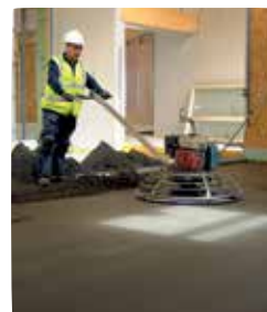
Cementitious Floor Grouts