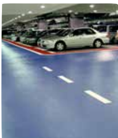
Parking Deck Systems