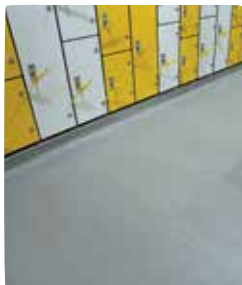
Fast Cure MMA